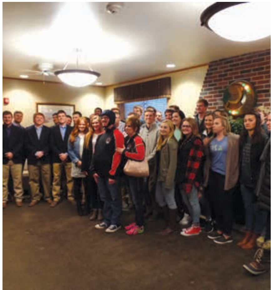
TOP - Legacy Fund Winners